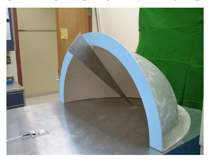
Figure 3: Reflector of a Prolate-Spheroidal IRA

The experimental setup basically includes basic three parts. These are prolate-spheroidal reflector, sampling-oscilloscope and pulse generator and they are presented in fig.2.