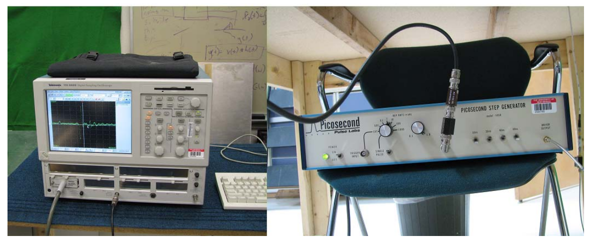
Figure 4: Sampling-Oscilloscope and pulse Generator

The feed arm that is located at the first focal point is aluminum. We use a B-Dot probe to measure the waveform at the second focal point. One can see the B-Dot probe that is located at the second focal point in fig. 3. However, this B-Dot probe is slow for our application; we need a faster probe.