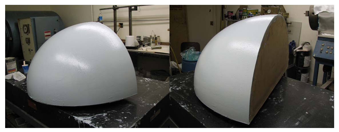
Figure 1: Reflector of the Prolate-Spheroidal IRA

The reflector in fig.1 is manufactured by Composite Graphite Company (Dave Laury, 505 2948120, CL@graphite.com). Fiber is used for manufacturing.